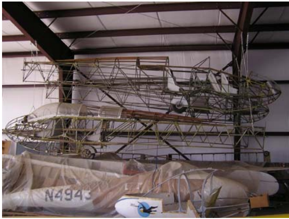
Gliders Awaiting Restoration, Tehachapi