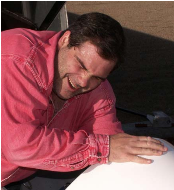
Folks, Do Not Leave Food in Your Glider